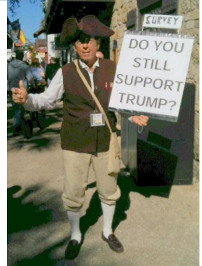
TCCR Staff Photo

The survey was conducted on Martin Luther King Jr. Day, January 18, 2021.